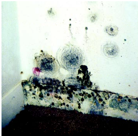
Photo 3A: Mold growing in closet as a result of condensation from room air