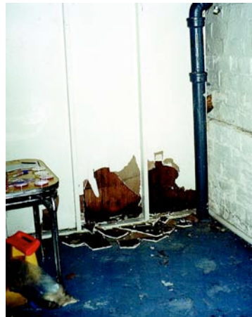
Photo 3B: Front side of wall-board looks fine, but the back side is covered with mold